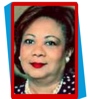
Dr. Florence Duperval Guillaume, Ph.D. Former Minister of Health, Haiti & Visiting Faculty, Empower School of Health, Geneva