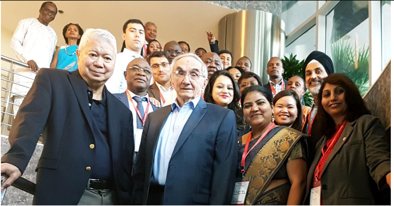
Group photo during the International Workshop on Strategic Leadership in Global Health and Development, hosted by Johns Hopkins Bloomberg School of Public Health and Empower School of Health in Dubai

Face-to-face workshop in Dubai (23rd – 27th April 2018)