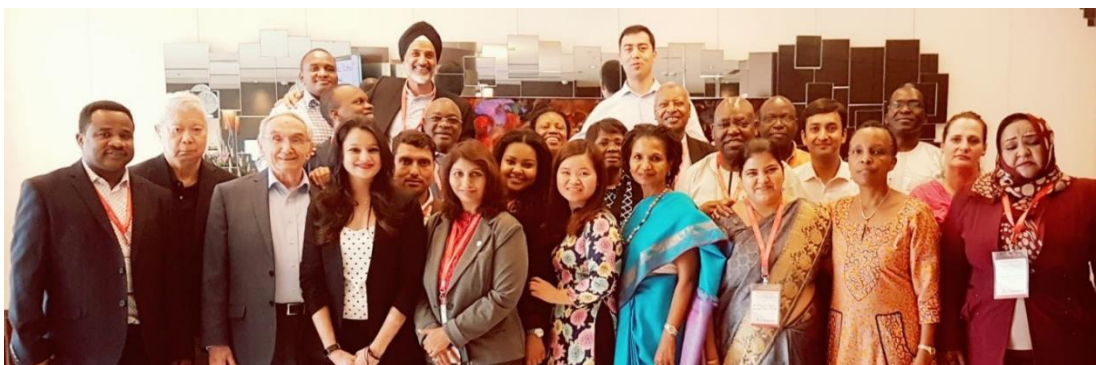
The Graduating Batch