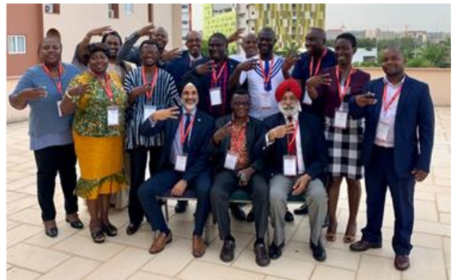
The Graduating Batch